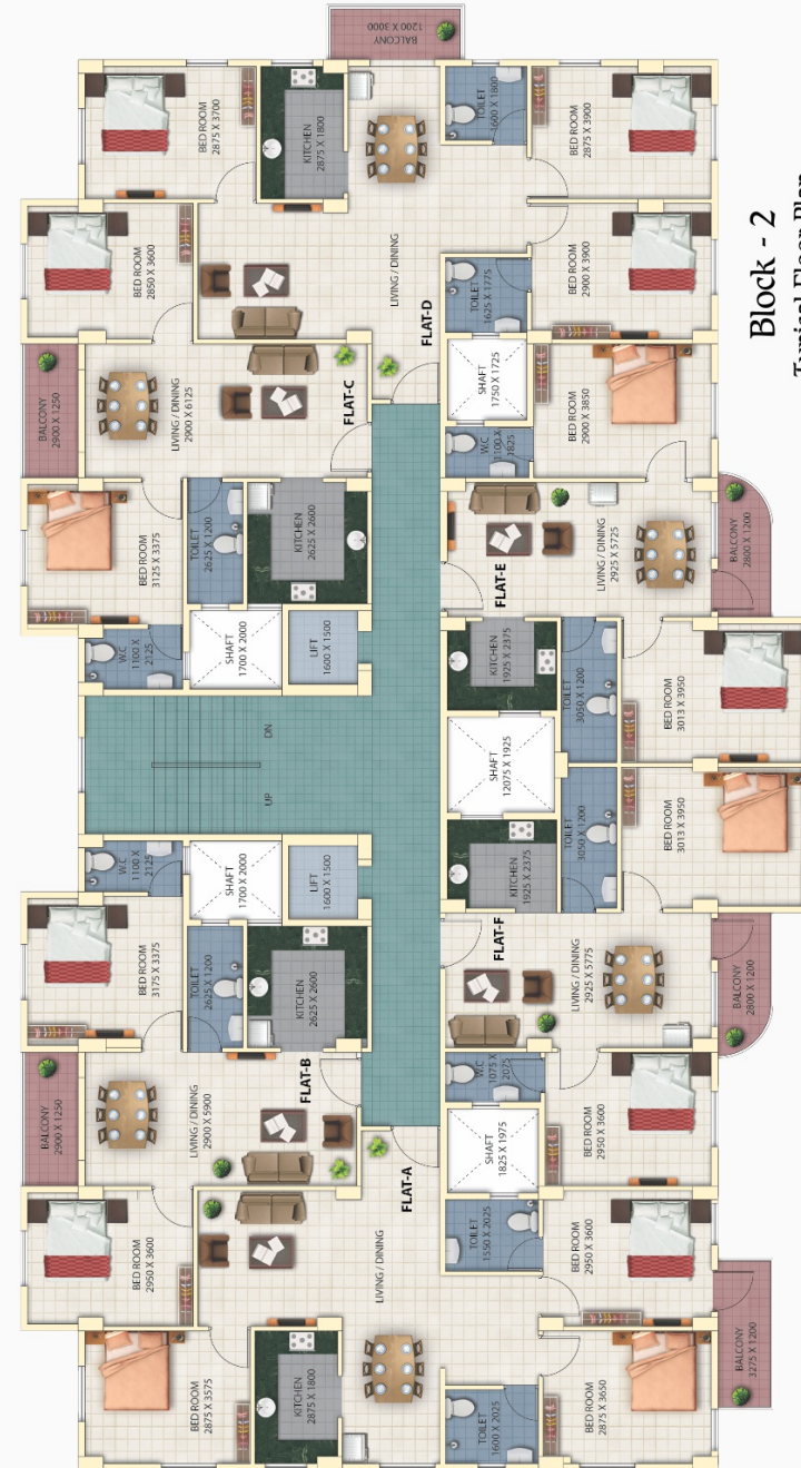
Block - 2 Typical Floor Plan